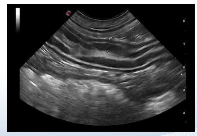
Dog - Small bowel - B-Mode